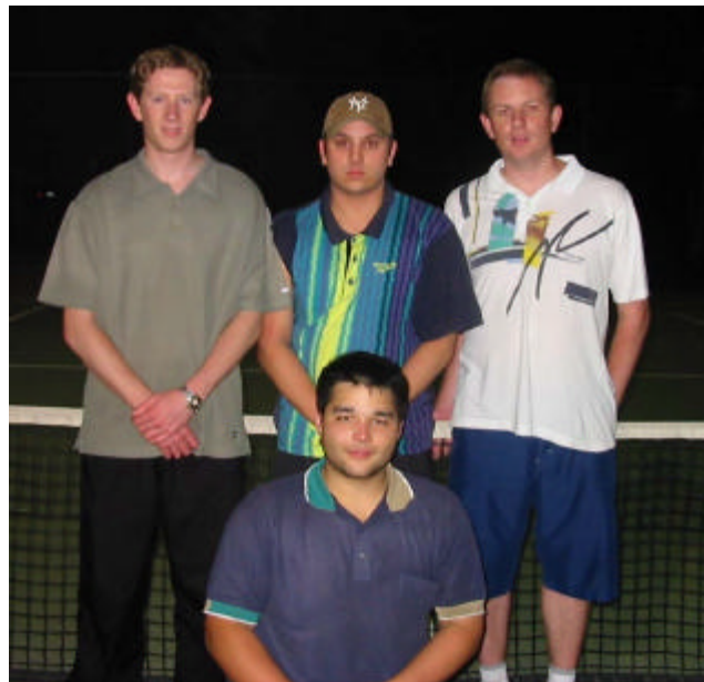
B Grade 3 Premiers

Good luck to all the teams for the rest of the season!