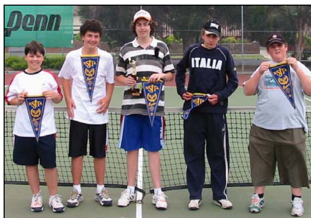
C Reserve 1 (Boys) - Premiers

St. Peter's will again be fielding ten teams in Season 1 2006, with two based at St. Bernard's and one team playing on a Friday night. For the first time in a long time, 3 of these teams are A Grade. Members should note that due to junior competitions on Friday nights, the courts will not be available for member use/hire from 7.00 pm onwards on 3 & 24 February, 10 March, 28 April and 12 & 26 May.