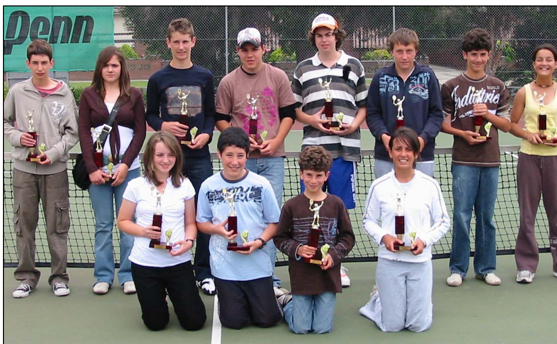
Season 2 2005 Trophy Winners