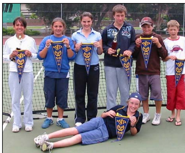
C Grade 2 - Runners-Up