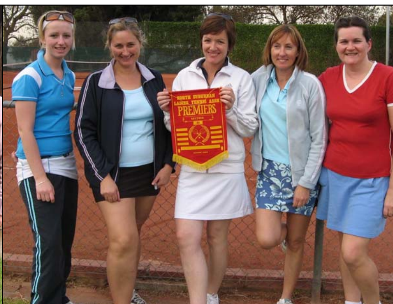
Tuesday WSLTA Section 6 — Premiers