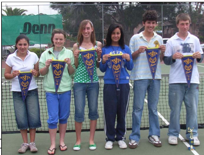
A Reserve 4 (Friday) - Premiers St. Peter's/St. John Bosco

So far the teams are going very well with 7 of the 11 teams in the top 4 at the half way mark of the season. Hopefully this success will continue for the rest of the season!