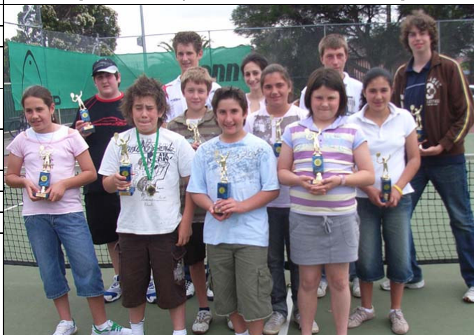
Season 2 2007 Trophy Winners